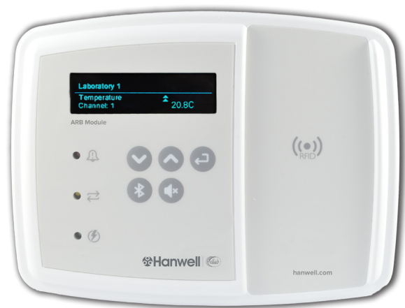
Product code: IN-NA002